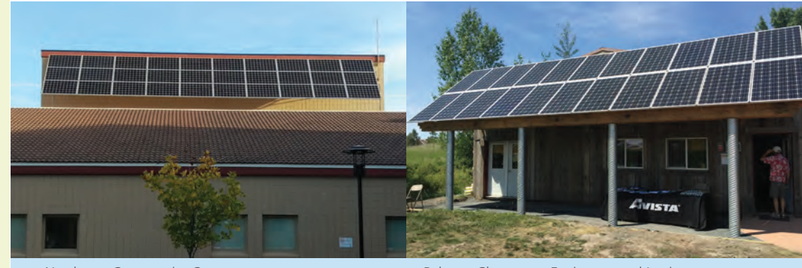
Northeast Community Center (Spokane, Washington) - 7.41 kilowatt solar array

To celebrate this 15-year milestone, Avista is providing a $15 treat. See reverse side for details.