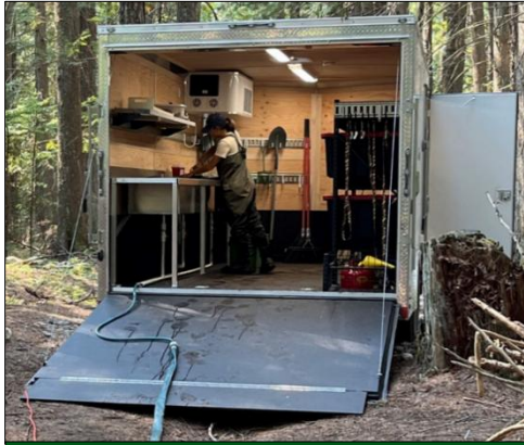
Fisheries working trailer at the East Fork Bull River tributary trapping site.

Fish trapping efforts for the East Fork Bull River under the Tributary Trapping and Downstream Juvenile Bull Trout Transport Program began with the installation of fish traps at the start of September. New fish trap boxes were installed that utilized fish retention devices – clear plastic fingers shown to impede a trapped fish’s ability to escape back through the trap’s entrance cone. Also new for 2025 under this program was the procurement, outfitting, and deployment of the fisheries working trailer at the East Fork Bull River fish trapping site. This new equipment will allow for more efficient fish capture and the ability for staff to work-up fish in a secure, mobile, and out-of-the-weather environment.