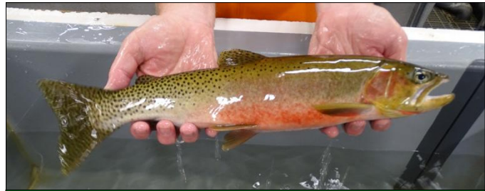
Adult Westslope Cutthroat Trout captured downstream of Cabinet Gorge Dam, transported to Montana in 2022, and recaptured and transported again in 2025.

Westslope Cutthroat Trout were initially transported upstream of Cabinet Gorge Dam in 2015 as part of an experimental transport program. This was the first time Westslope Cutthroat Trout had been moved past the dam since dam construction. Experimental transport continued annually through 2018 with fish radio tagged and their movements monitored to learn more about fish behavior following transport. Following 2018, Westslope Cutthroat Trout captured downstream of Cabinet Gorge Dam have