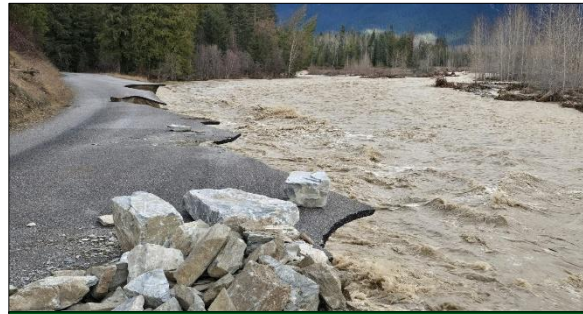
Effects of the December rain-on-snow flooding on Lightning Creek.