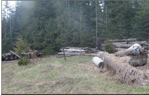
Power poles and debris at Twin Creek prior to removal.

A large amount of old wooded power poles had been previously stockpiled at the Twin Creek Day-Use Area, which is jointly operated by Avista and IDFG. A project was initiated to remove the power poles and remediate the area to prevent creosote preservative from leaching into the soil. Avista hired a contractor to remove and dispose of the poles in accordance with applicable regulations. The area will be allowed to regenerate with native vegetation.