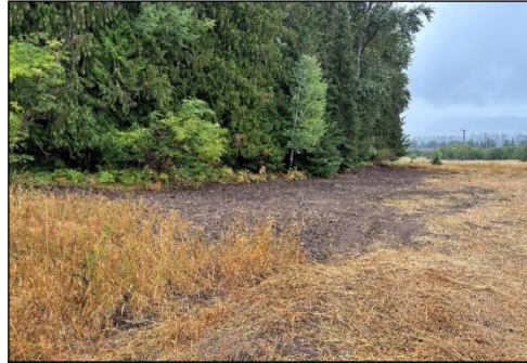
Area following debris removal.

To address prior tree clearing activities at Two Rivers RV Park and Campground, Avista proposed a project to clear remaining debris and stumps to improve the overall aesthetic of the campground, and to facilitate easier lawn maintenance. Additionally, the removal of the stumps would help to prevent damage to vehicles and travel trailers which may back into or over them. Stump grinding and debris removal was completed in November during the campground off-season.