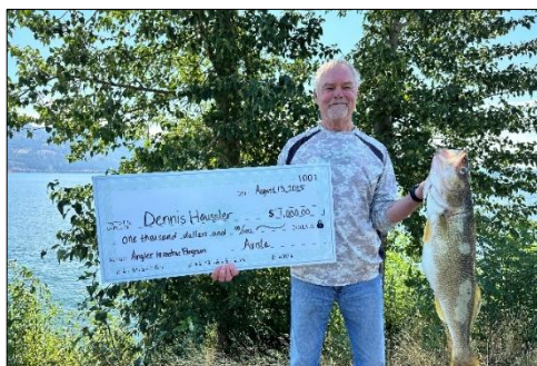
Angler receiving a $1,000 reward for harvesting a Walleye that contained a coded wire tag from Lake Pend Oreille, Idaho.

The Walleye angler incentive program has been implemented since 2019 to financially incentivize anglers to harvest Walleye. This program rewards anglers that turn in Walleye heads via a raffle to win $100 gift cards or a direct payment of $1,000 for coded wire tagged Walleye. The angler incentive program in 2025 was highly successful with 4,842 Walleye removed by 531 unique