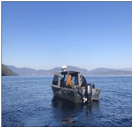
2025 Management Committee fall boat tour.

At the fall MC meeting, Avista led a mini workshop focused on knowledge sharing with several founders of the CFSA, including both current and retired MC members. The session provided historical context on the lead-up to the CFSA signing, highlighted key issues at the time, and explored varying perspectives from different stakeholder groups. Participants were asked and answered important questions such as: What recommendations would you give the group today? What lessons were learned? What was the original concept for relicensing? A key insight was that the initial assumption was for the CFSA to carry forward into the next license and be re-signed during relicensing. Additionally, the discussion underscored that staff transitions at signatory organizations have been one of the greatest challenges to maintaining continuity over the years. Following the meeting, participants attended Lake Pend Orielle tours led by Idaho Department of Fish and Game (IDFG).