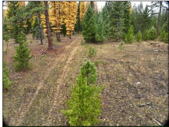
Newly cleared roads at Tuscor BMA.

First proposed in 2024, Avista worked with Montana Fish, Wildlife and Parks (MFWP) to develop a limited road system within the Tuscor Block Management Area (BMA) to provide improved access for hunters with mobility limitations. Most BMAs lack road systems suitable for hunters holding a Permit to Hunt From a Vehicle (PTHFV), making this a unique opportunity for an underserved user group. The road system allows vehicle access to areas that are otherwise difficult to reach, increases the potential for a successful hunt, and reduces off-road impacts by concentrating travel on maintained roads. Construction was completed prior to the 2025 general rifle season, and access is managed through an MFWP reservation system to avoid conflicts between PTHFV and on-foot hunters.