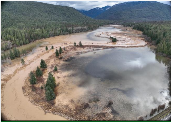
Runoff due to the December rain-on-snow event in the Bull River.

Thankfully, effects to resources associated with implementation of the CFSA were minimally impacted. There was damage to some of the passive integrated transponder (PIT)-monitoring stations in various streams that have yet to be thoroughly assessed. However, most systems are still largely operational. The largest potential impact could be to Bull Trout production in area streams. It is possible that in-gravel survival of incubating Bull Trout embryos was low due to scour or entombment through the deposition of fine sediments. To understand these effects, we will have to wait until 2027 relative abundance monitoring when Bull Trout are effectively sampled through electrofishing.