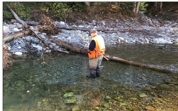
Bull Trout redds within the Grouse Reach channel restoration area.

Project monitoring for the Grouse Reach is conducted by the United States Geological Survey (USGS) and funded under CFSA Appendix B. Monitoring focuses on groundwater effects and basic productivity to inform future restoration efforts both at this site and across the western U.S. An encouraging result was the observation of five Bull Trout redds within the reconstructed Grouse Reach in October 2025.