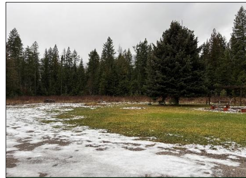
Overview of campground following removal of debris and stumps.

A historic rain-on-snow event in mid-December brought substantial flooding to many of the tributaries to the lower Clark Fork River. Montana Governor Gianforte issued an executive order declaring a flooding disaster in northwestern Montana associated with the event. There were washouts of numerous roads and bridges in the region, the city of Libby struggled to deliver clean drinking water, and thousands of residents were without power for up to a week.