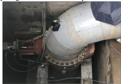
CGFPF siphon pipe showing the flow control valve (orange) and pressure sensor installed for siphon vibration testing.

flows through the facility to attract target fish into the trap originates in the forebay of Cabinet Gorge Dam. Water is siphoned from the forebay through two large pipes and controlled by valves located under the deck of the trap, close to where the water exits into the structure. During the first year of operation, significant pipe vibration was observed near the valves at higher siphon flows. This vibration has affected the integrity of siphon pipe supports and has led to multiple short-term shutdowns of the CGFPF.