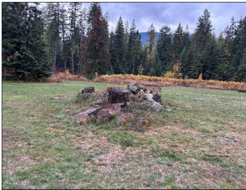
Stump and debris prior to project.

To address prior tree clearing activities at Two Rivers RV Park and Campground, Avista proposed a project to clear remaining debris and stumps to improve the overall aesthetic of the campground, and to facilitate easier lawn maintenance. Additionally, the removal of the stumps would help to prevent damage to vehicles and travel trailers which may back into or over them. Stump grinding and debris removal was completed in November during the campground off-season.