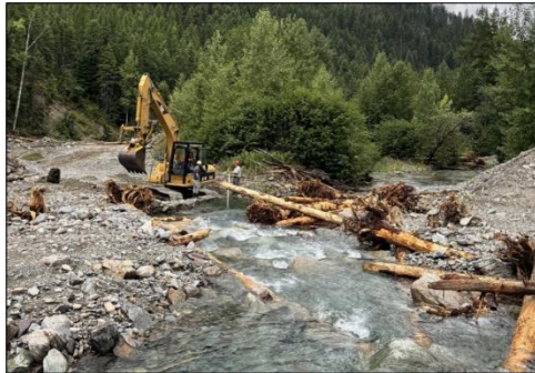
Grouse Reach channel restoration construction.

Efforts to restore stream channel and floodplain function within the Vermilion River continued in 2025 with the implementation of the Grouse Reach channel and floodplain restoration project. The fourth such project enacted since 2012 involved the construction of over 2,000’ of complex and sinuous stream channel and improvements to over 10 acres of adjacent floodplain. This project adds to the over 4,400’ of previous projects, which represents a large-scale restoration for this important Bull Trout tributary. Design for this project, as well as contributions towards revegetation, was funded under CFSA Appendix B, while over $400,000 in Federal