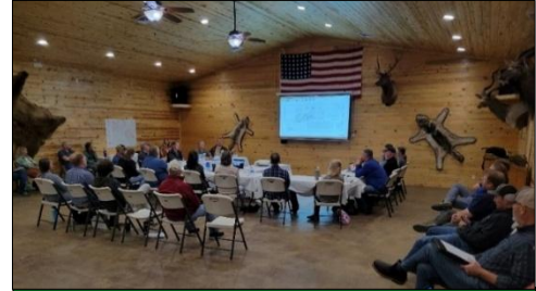
2025 Management Committee fall meeting.

Avista, through CFSA Appendix R, continued to work with Idaho and Montana State Historic Preservation offices, the U.S. Forest Service (USFS), and representatives from five Native American Indian tribes (Confederated Salish and Kootenai, Coeur d'Alene, Kootenai, and Kalispel), collectively referred to as the CRMG, to preserve and protect cultural and historic resources associated with the Clark Fork Project. In 2025, the Avista Cultural Resource Specialist and/or the CRMG reviewed 81 CFSA-related projects with proposed ground disturbance and/or projects related to the Noxon Rapids and Cabinet Gorge HEDs.