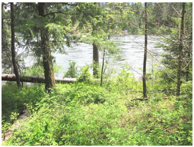
Figure 2. Treend Property