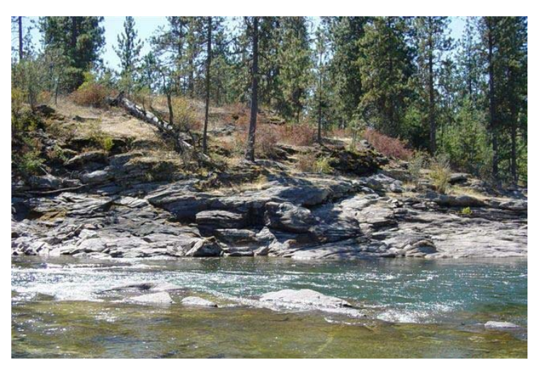
Figure 3. Thompson Property

The Thompson/Lost Mine LLC property (Thompson Property) ( Figure 3 ) is one of the two preferred locations for the access site. The shoreline of the property is located on the south side of the river and is contiguous to the Wave. The Thompson property is presently privately owned, and the owner is planning a limited housing development. Discussions with the property owner and his developer have been positive and the developer has agreed to consider the idea of partnering to develop a community access site. However, development of the property is currently on hold, pending permit applications and an emergency egress alternative. The developer has also indicated that enthusiasm for the housing project is dwindling given the current economic situation.