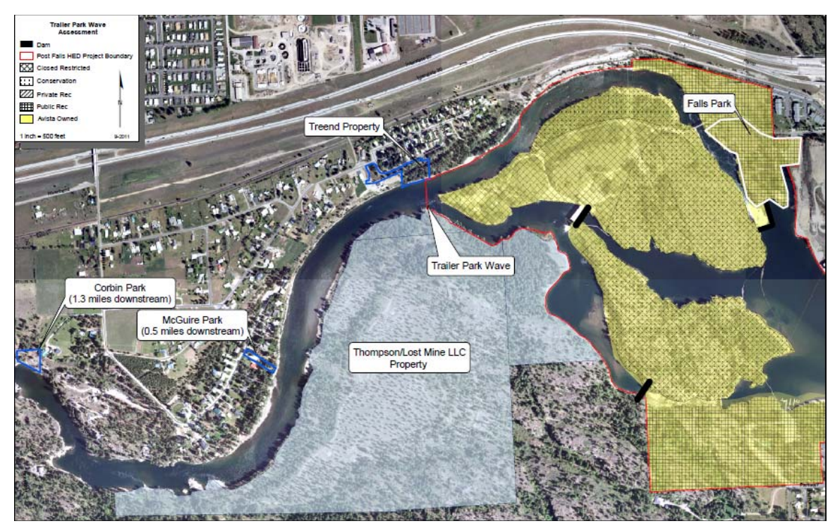
Figure 1. Area Map

Avista, working in collaboration with the local canoe and kayak club and others involved in the recreation and whitewater studies during Project relicensing, and in consultation with the Agencies, began identifying and assessing potential Wave access sites soon after the Project license was issued. Evaluation criteria included the site's proximity to the Wave, the site's ability to provide a carry-in-only boat launch, adequate vehicular access and parking, and a toilet. Also, because most lands near the Wave are privately owned, most site alternatives would require property owners to sell land or easements for public access. To date, four properties were identified and assessed for the access site.