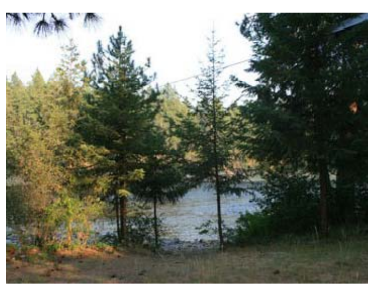
Figure 4. McGuire Park

Whitewater boaters expressed concern over access at McGuire Park due to the inability to view the rapid from the site to determine flows and safety considerations. Posting flow information on the Internet and telephone (discussed later) has helped alleviate that issue. Boaters were also concerned about the park's limited vehicle parking. Expanding the parking area, which holds up to eight vehicles, is unlikely because the park is a very narrow strip of land confined with homes on either side.