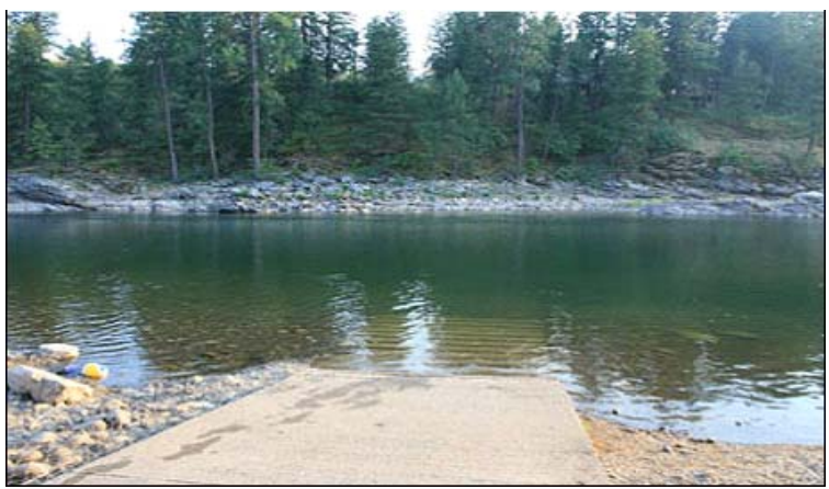
Figure 5. Corbin Park

Corbin Park ( Figure 5 ) is located on the north side of the river downstream of McGuire Park. This location requires a 1.3 mile paddle and/or hike to access the Wave. Corbin Park is owned and operated by the Post Falls Parks and Recreation Department. It is a 28 acre site that offers water access for rafting or fishing, picnicking, sports fields and courts, and restrooms. Avista and the Agencies agree that this site is too far downriver to be considered a feasible Wave access location.