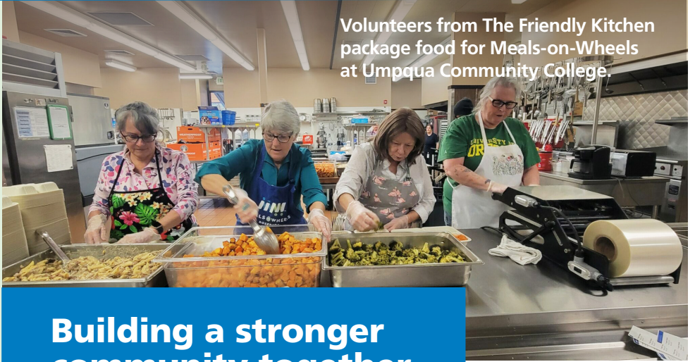
Volunteers from The Friendly Kitchen package food for Meals-on-Wheels at Umpqua Community College.